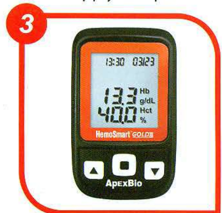
Results in 5 seconds