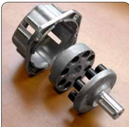
Integrated elastic joint, for best pump coupling (except model 1211).