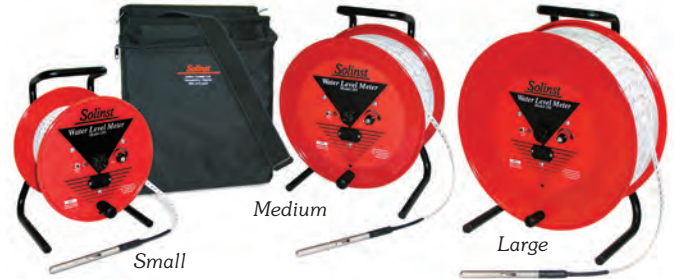
Model 101 Water Level Meter Reels

* Polyethylene tapes are only available in these lengths