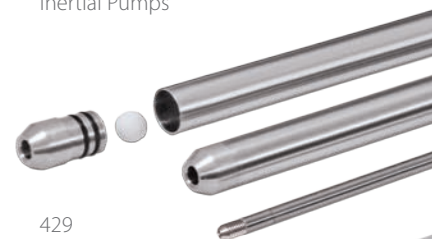
429 Point-Source Bailers