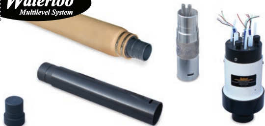
Standard Waterloo System Components, Including Packer, Port (Dual Stem), PVC Casing, PVC Base Plug, and Manifold

The 401 Waterloo Multilevel System allows detailed groundwater monitoring from many zones in one borehole.