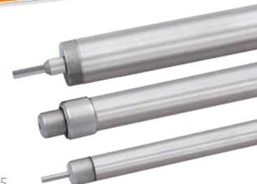
425 Discrete Interval Samplers

The 800 Low Pressure Packers are simple, inexpensive and inflate with a hand pump. They come as single or straddle packers and can be lowered into the well from a rope tether or a rigid PVC pipe. The 103 Tag Line can be used as a marked safety line. Available in sizes to fit wells and boreholes from 1.9" – 4.5" (48.3 – 114.3 mm) to a maximum pressure of 50 psi (345 kPa) for the smaller packer and 30 psi (205 kPa) for the larger packer.