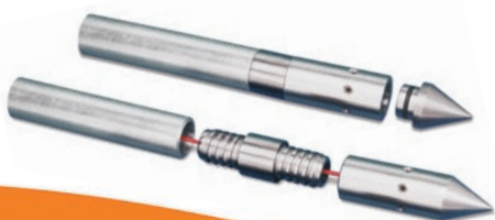
660 Drive-Point Profiler

The 660 Drive-Point Profiler allows collection of groundwater samples from multiple points, at discrete zones, in a single drive. This allows a detailed vertical profile with only one drive of the rig. The profiler tip is connected to a Peristaltic Pump which flushes the profiler tip with de-ionized water during driving to prevent cross contamination and is reversed to obtain a sample. It allows detailed plume delineation quickly and inexpensively. An expendable grout tip is available to allow easy decommissioning.