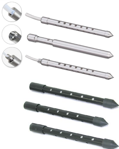
615 Drive-Point Piezometers

Drive-Point Piezometers are ideal for initial site investigations. They provide a low cost, minimal disturbance approach for determining the existence of contaminants in temporary boreholes. Samples can be taken from multiple discrete depths across a site; providing high resolution data, quickly.