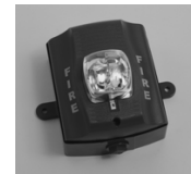
Outdoor Wall Strobe