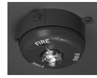
Outdoor Ceiling Strobe