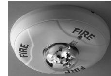
Indoor Ceiling Strobe