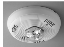
Indoor Ceiling Horn/Strobe