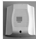
Indoor Wall Horn