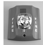
Indoor Wall Horn/Strobe