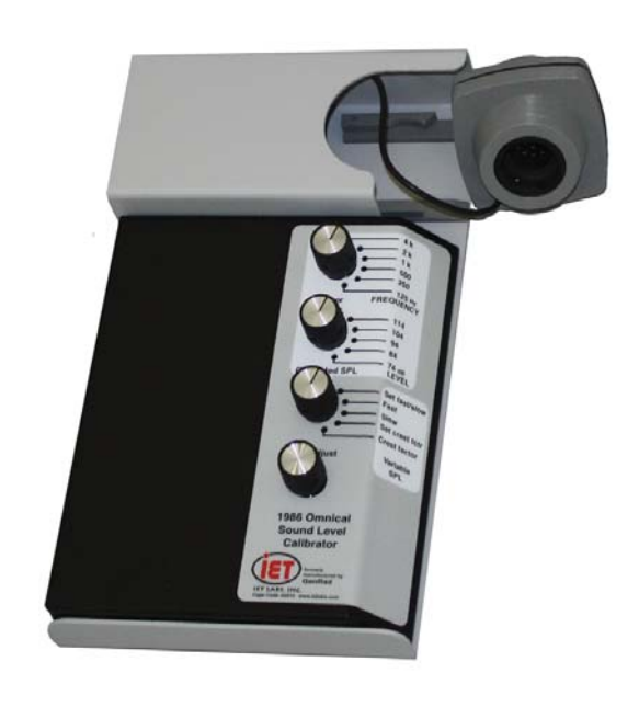
1986 Omnical Sound Level Calibrator

The two sources of linearity error in a sound measuring instrument are easily checked with the 1986. One source is the indicator scale (meter or digital display) and the other source is the level range control.