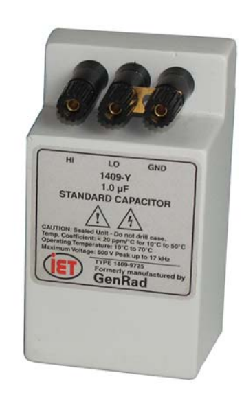
1409 1 µF Standard Capacitor