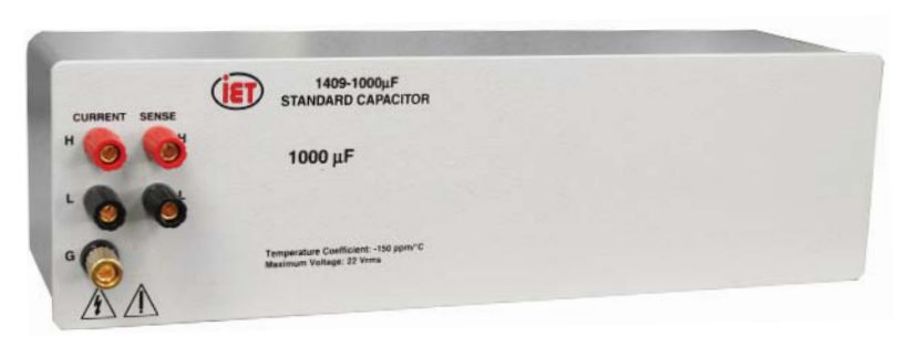
1409 Model, 1000 μF value