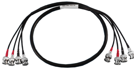
bnc-bnc Extender Cable, 2-Meter

(Requires Remote Test Fixture: 1689-9600)