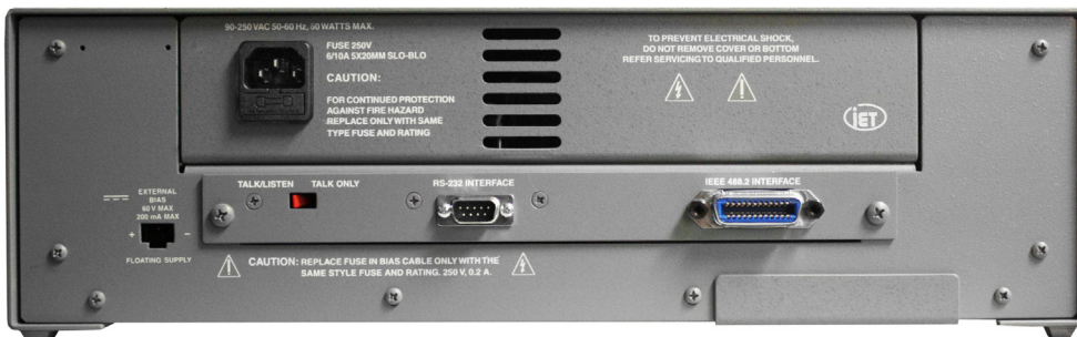
Rear view of 1693 RLC DigiBridge with optional IEEE-488 interface

The combination of its high-accuracy, wide range of impedance parameters and test conditions, and automated functions make the 1693 DigiBridge ideal for production testing, component design and evaluation, process monitoring, and dielectric measurements.