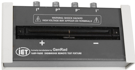
Remote Test Fixture