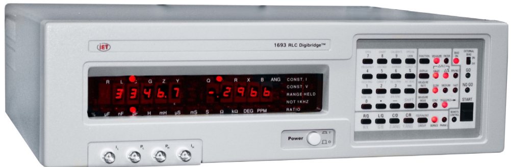
1693 RLC DigiBridge

The GenRad 1693 RLC DigiBridge provides the best combination of features designed to optimize productivity in all testing environments. This bridge features highly accurate measurements of 11 impedance parameters and testing versatility through selection of a wide-range of test frequencies, speeds, and voltages. Its easy-to-read, dual display shows both primary and secondary measurement parameters.