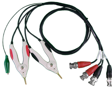
Kelvin Test Leads