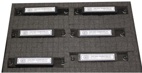
Digibridge Calibration Kit

(May also be used as bnc-to-banana-plug connector)