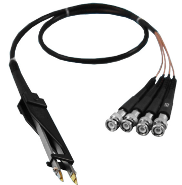
Chip Component Tweezers