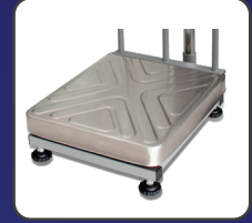
Wider platform size