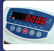
High bright red led display