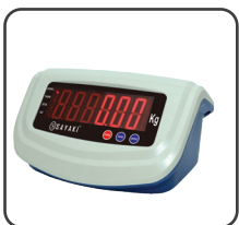
High bright red led display

SAYAKI NI-7 gives you the tools to improve profitability and efficiency in many weight-based processes across the food, logistics, mining, waste, metals and engineering industries.