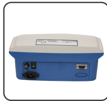
Rear view indicator

Full Press 304 stainless steel platter durability for use