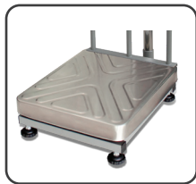
Wider platform size