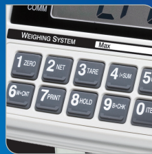
Numeric & function keys