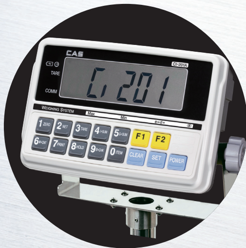
CI-201A with optional pole bracket

Applicable for various weighing applications, with the added flexibility of manually setting functions via numeric keys. With various power supply options, the CI-200A series is highly portable and ideal for environments where power outlets are not available or power outages often occur.