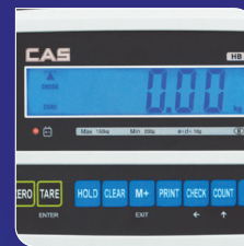
Blue backlight LCD