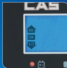
Check-Weighing Function (HI/OK/LO)