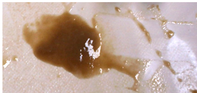
Effective at Biofilm Removal