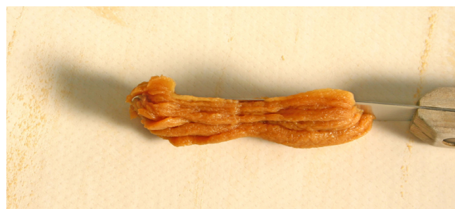
Disrupts biofilm to maintain clean membranes