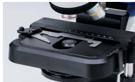
Rackless stage and stage cover