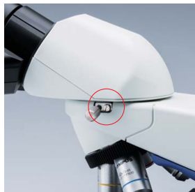
Locking pin for easy binocular rotation