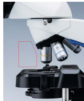
Inward-facing revolving nosepiece