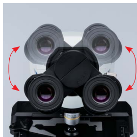
Eyepoint height adjustment