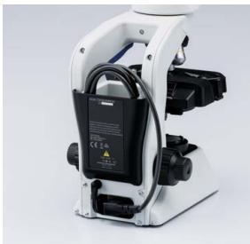
Convenient and easy access power cable storage