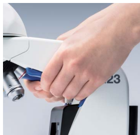
Ergonomic grip for easy carrying