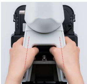
Angled arm enables comfortable carrying