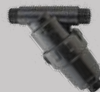
F6100 Plastic Screen Filters (3/4")