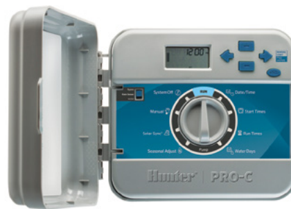
Plastic Indoor Height: 22.9 cm Width: 25.4 cm Depth: 11.4 cm