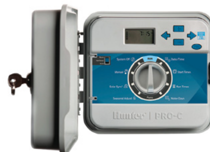
Plastic Outdoor Height: 22.9 cm Width: 25.4 cm Depth: 11.4 cm