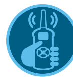
ROAM Remote Page 137 ROAM XL Remote Page 138