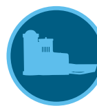
Solar Sync Sensor Page 146