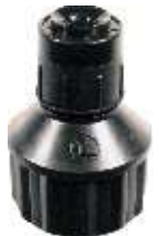
Spectrum™ Thread 1/2" FNPT