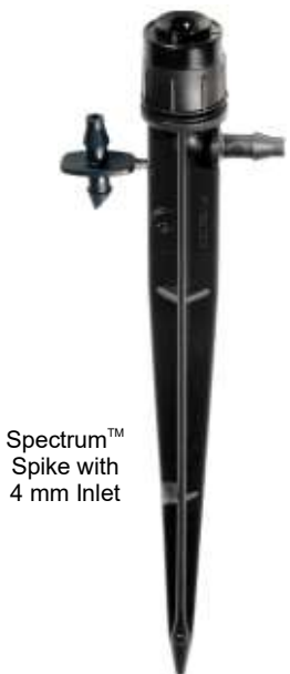
Spectrum™ Spike with 4 mm Inlet