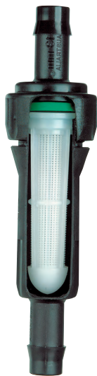
In-Line Filter screen detail